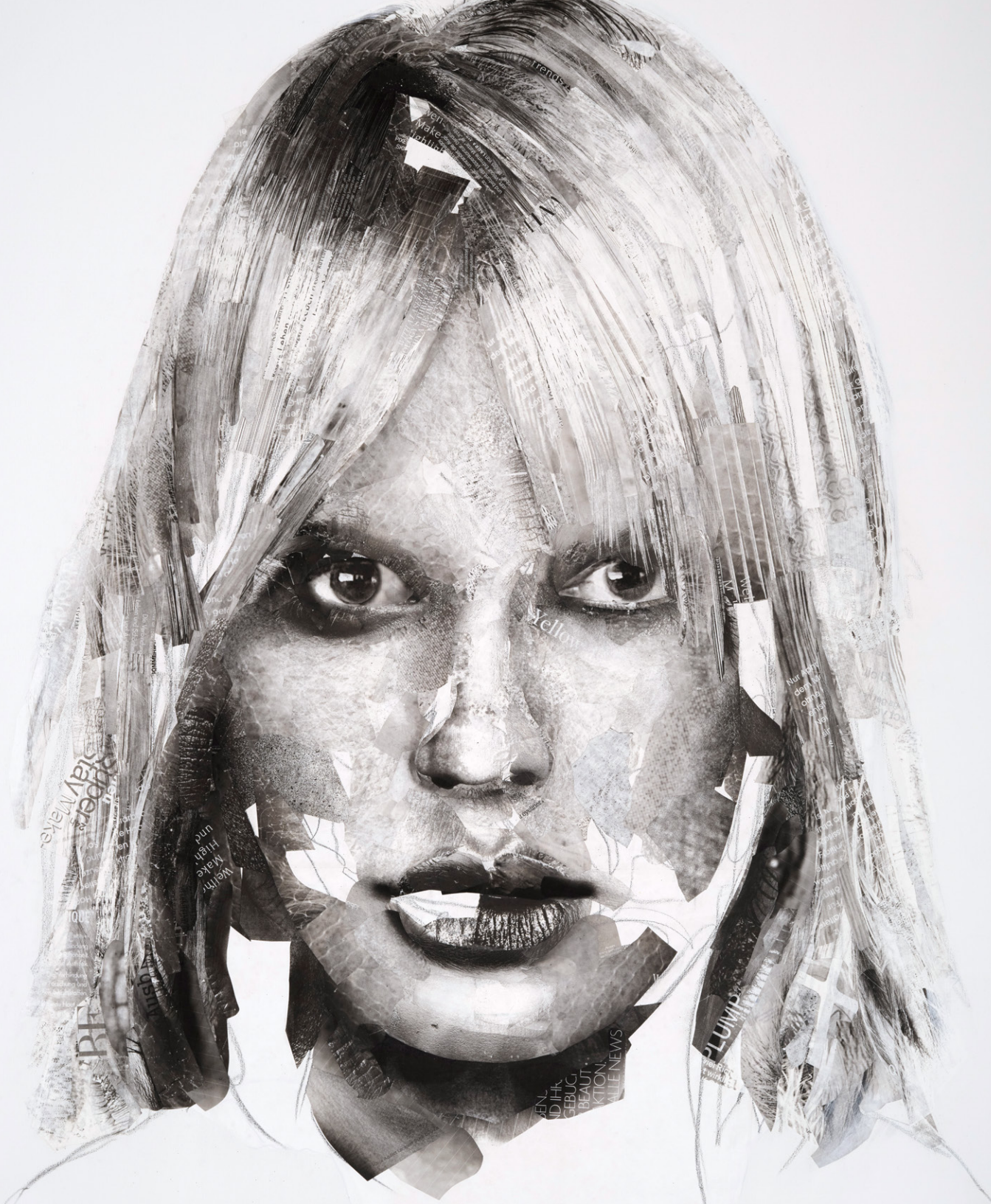
SUPER 24H paper collage & black crayon on canvas 55 x 47" / 140 x 120 cm