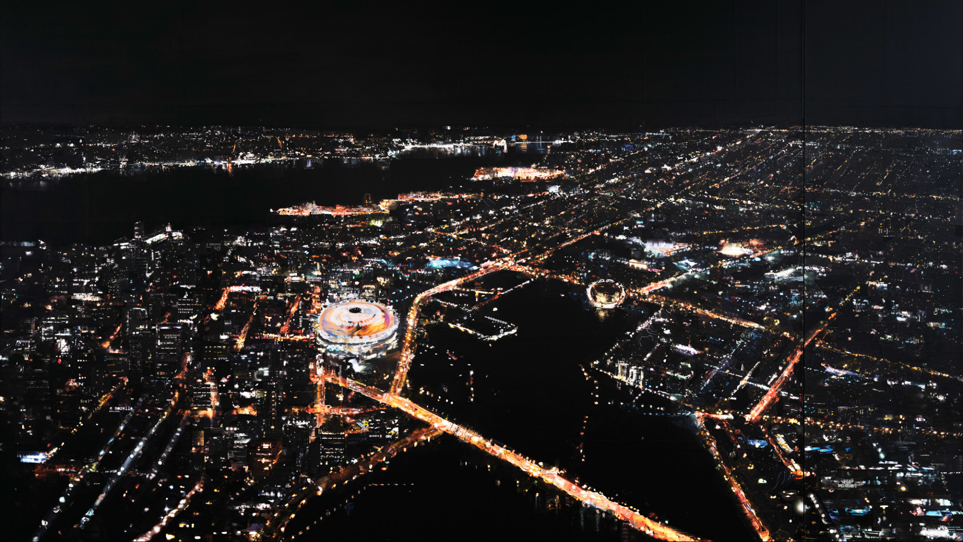
UPPERWARE (diptych of Vancouver) paper collage & acrylic on canvas 55 x 95" / 140 x 240 cm

When Gabi Trinkaus completes her works, she reflects that they are freed and live their own lives. What the viewer then sees Trinkaus cannot answer. Thoughts and reactions of all possible dimensions emerge. Undeniable however is the pulse of energy, ideas and emotions that weaves through her nightscapes and model 'makeovers'. These compositions of 'micro-analysis' collage become profoundly irresistible. Their artistic pulse ultimately triumphs in the continuation of a language for which there practically are no words.